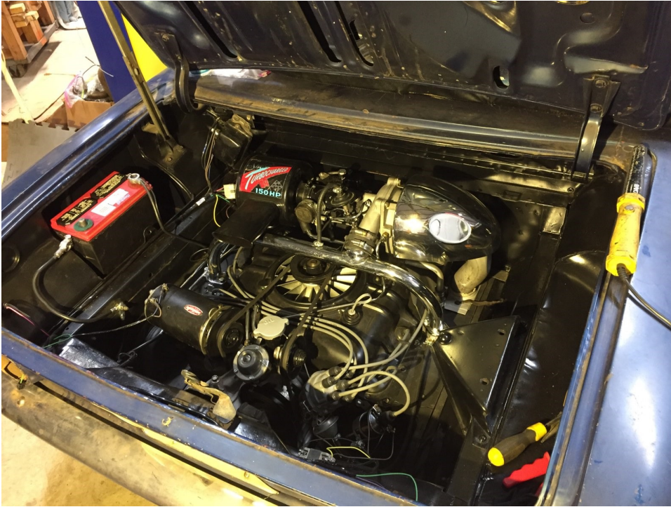
Parting out another one at Kens