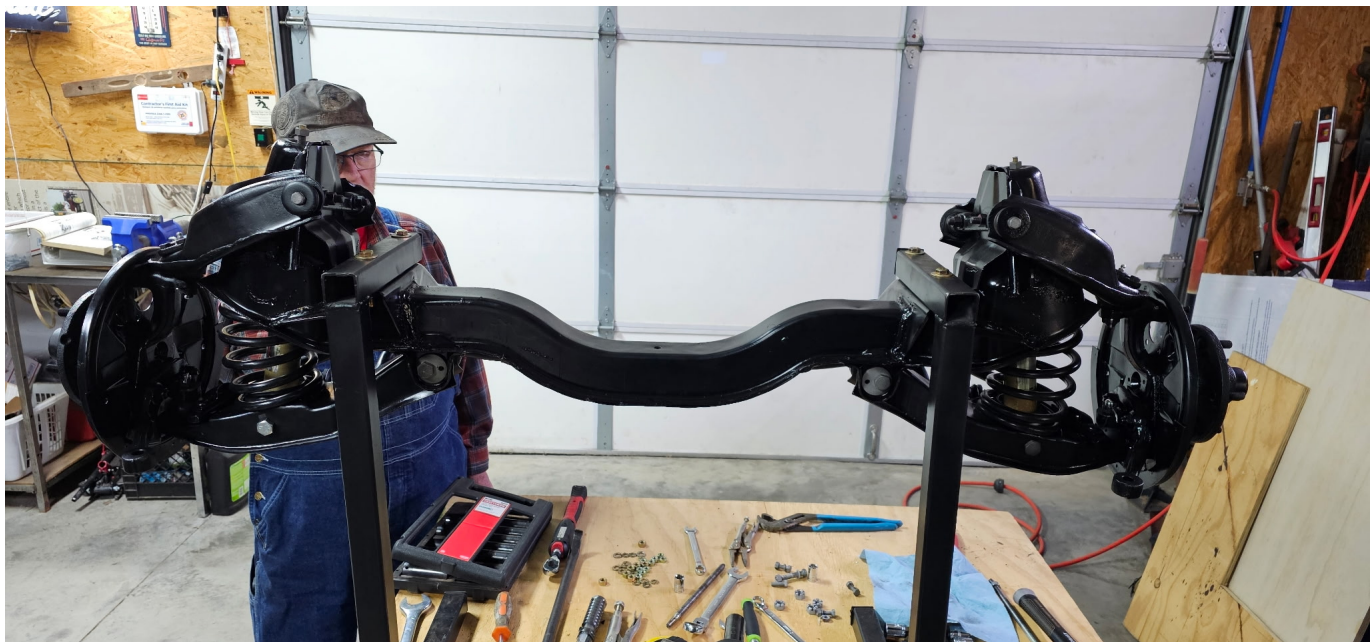
Complete late model front end rebuild at Pats shop. James and Pat working on this.