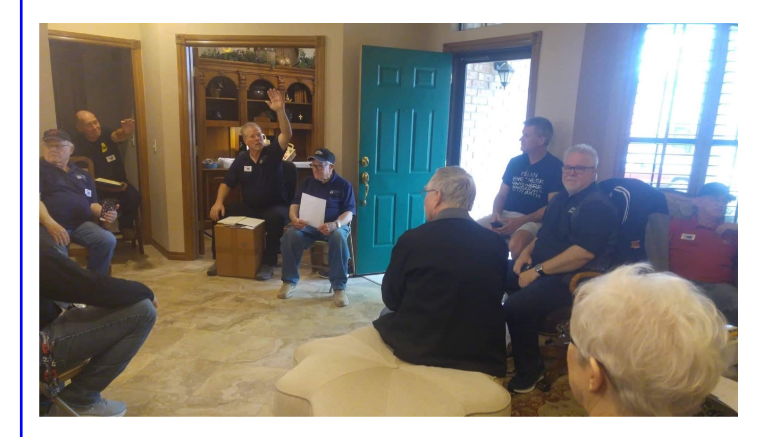
April Meeting at the Nels house