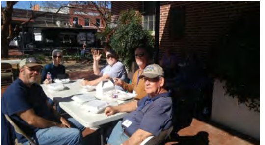
BINGO what Fun