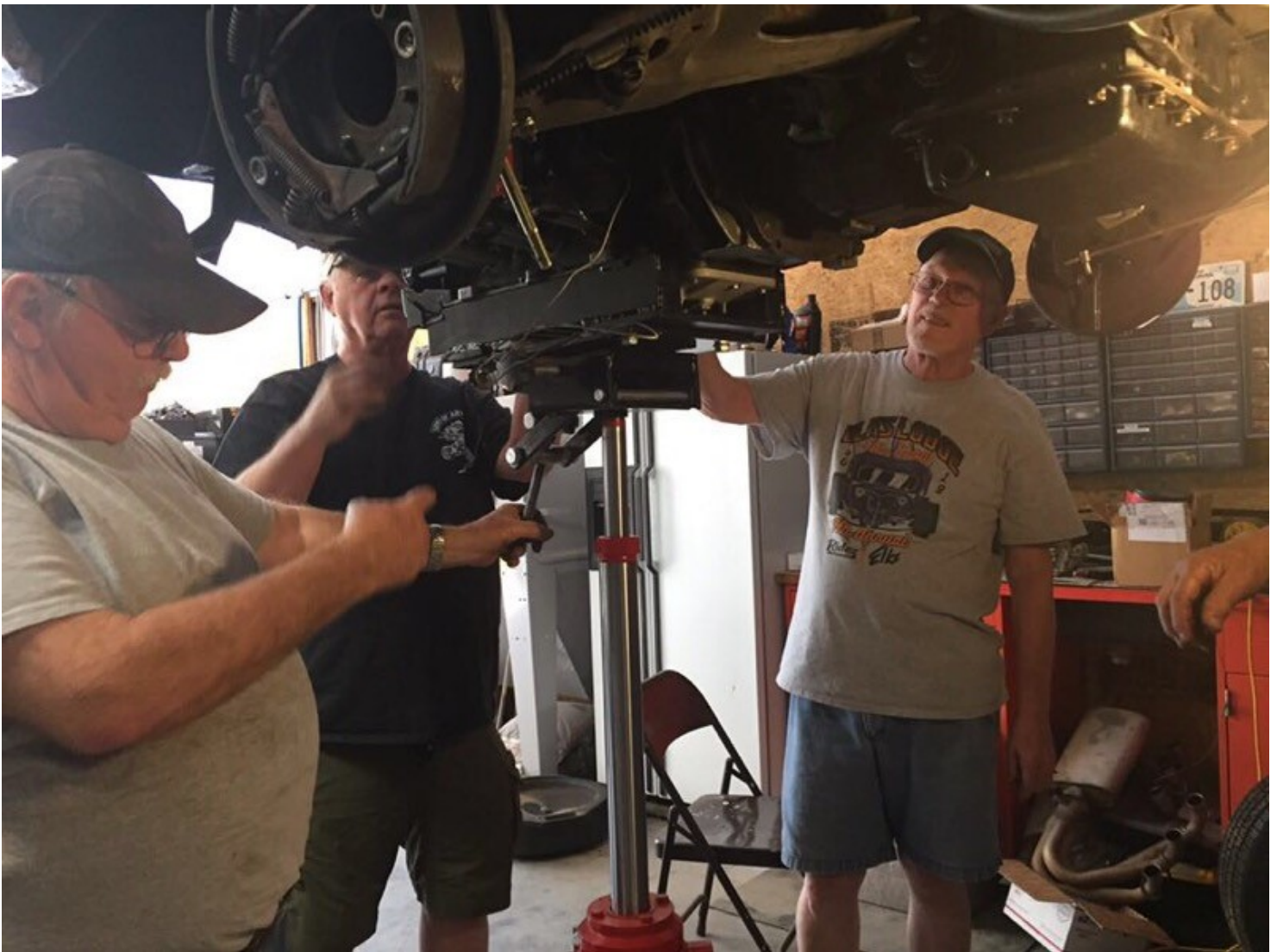
Working on Blue